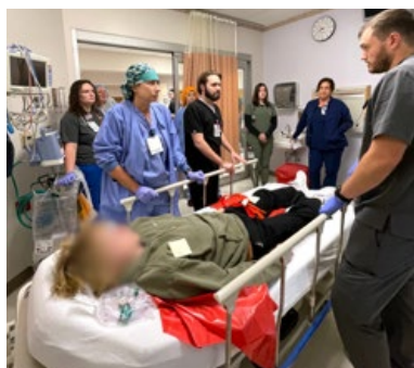
Conemaugh Miners Medical Center and Cambria Heights School District held an active shooter drill with emergency services, including local fire departments, emergency medical services and the Hospital and Healthsystem Association of Pennsylvania.