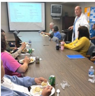
Conemaugh Miners Medical Center hosted a fire extinguisher training class for the hospital staff and members of the community.